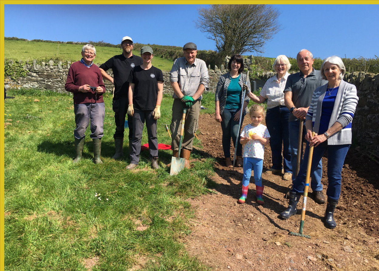
Chivelstone Church graveyard wildflower meadow creation – a trial community LotE project. Before ...