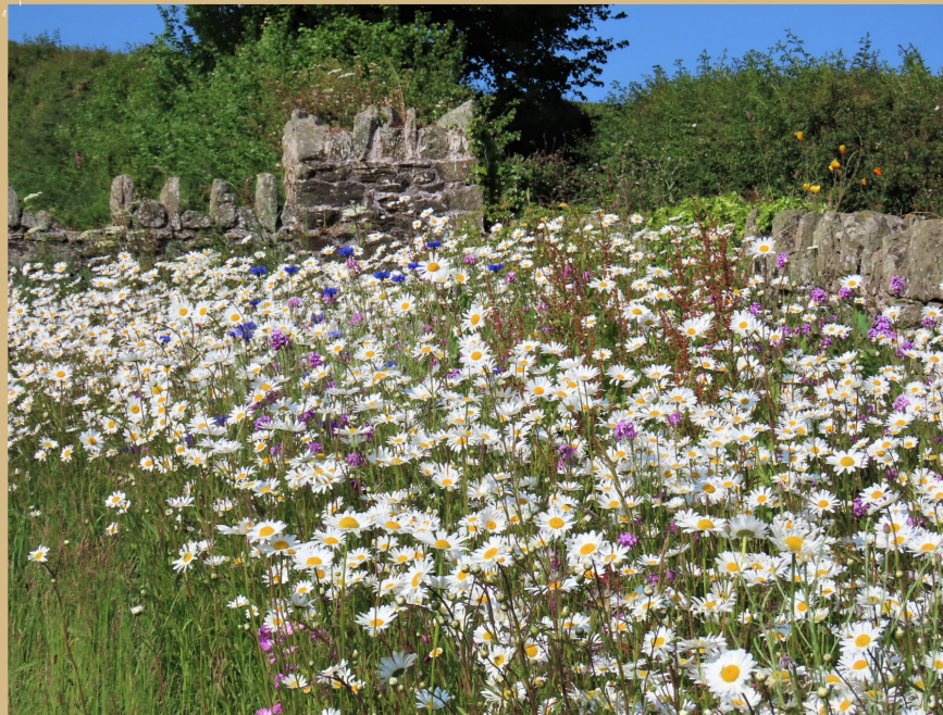
and after! Chivelstone Church graveyard wildflower meadow - a community LotE project

We will follow the criteria for acknowledging the grant which we have been given by the NLHF, badging this up as part of Life on the Edge. We will work closely with the AONB Comms officer and the Comms Intern to look for opportunities for press coverage and make full use of this potential.