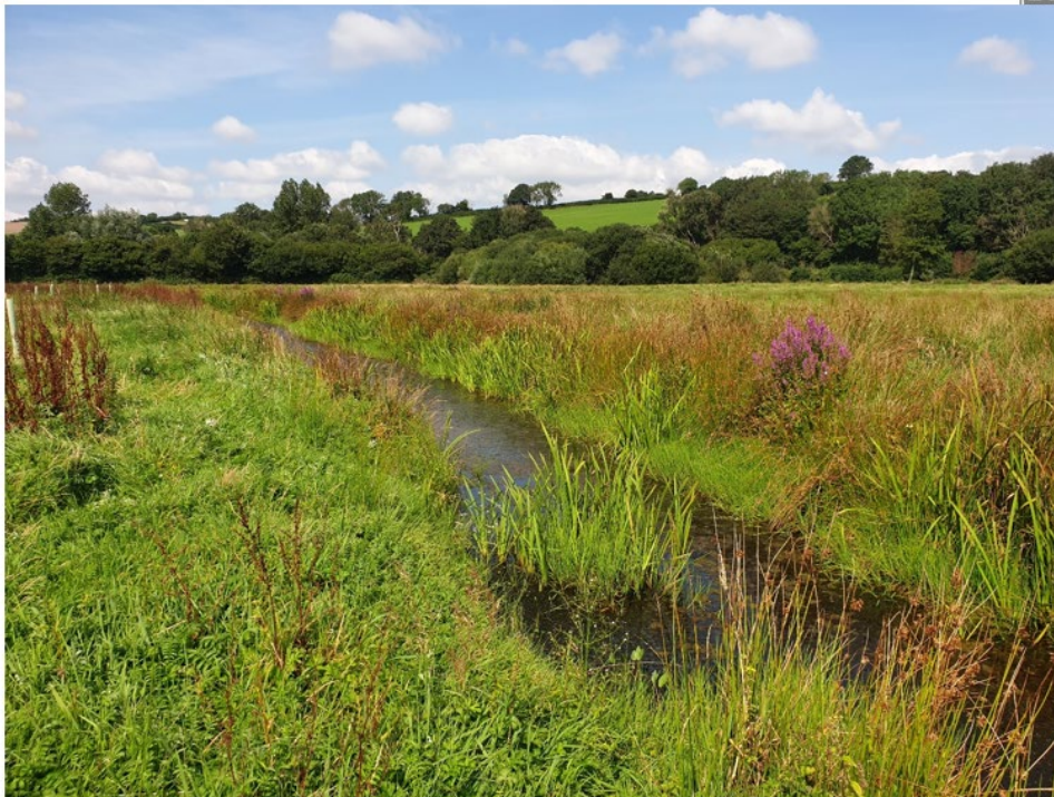
Good water vole habitat – a slow-flowing ditch with open, unshaded grassy banks.