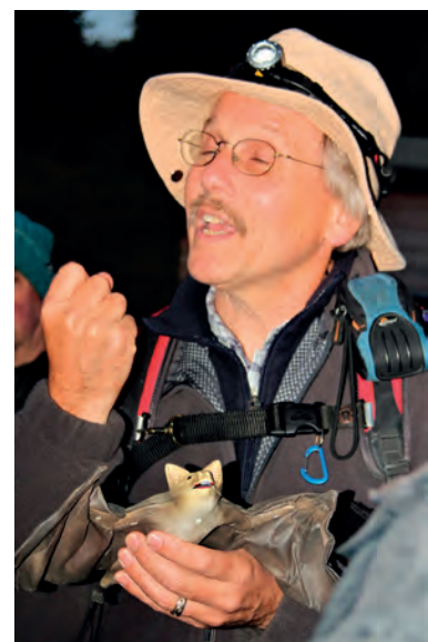
Bat event at Ham Farm

Once a year the AONB Family gathers together in celebration of the UK's outstanding landscapes. They worked together to organise a nine day long programme of events to help people enjoy and be inspired by Britain's Areas of Outstanding Natural Beauty. September has always been an outstanding month in our countryside, with harvests being brought safely home, trees and meadows taking on their autumnal colours, skies offering a full palette of hues, musky bonfires lingering in the evening air and a welcoming calmness for visitors.