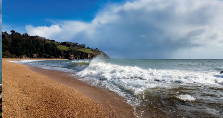
Blackpool Sands, stunning conference venue