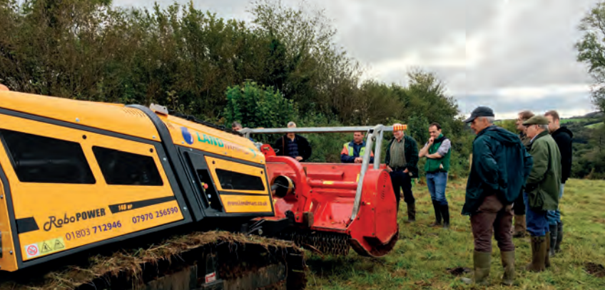
Robo-scrub clearance demonstration