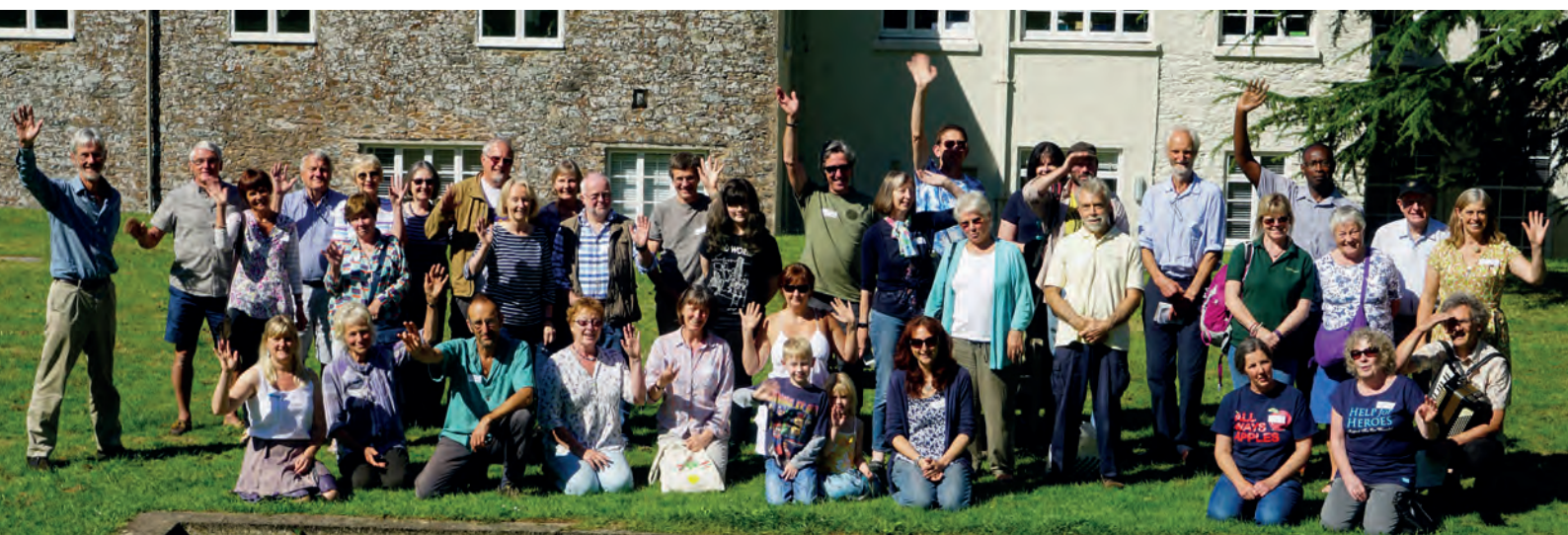
Celebration Event July 2017

The project was showcased at the Landscapes for Life conference as a nominee for The Bowland Award