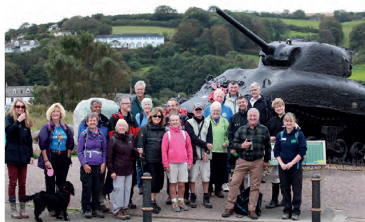
BBC Radio Devon Walk

The South Devon team led a guided walk for BBC Radio Devon from Torcross looking at the wartime coastal defences and biodiversity of the area, organised a bat walk jointly with the Devon Greater Horseshoe Bat Project and led a beach clean at Scoble. Over 100 events were staged nationwide.