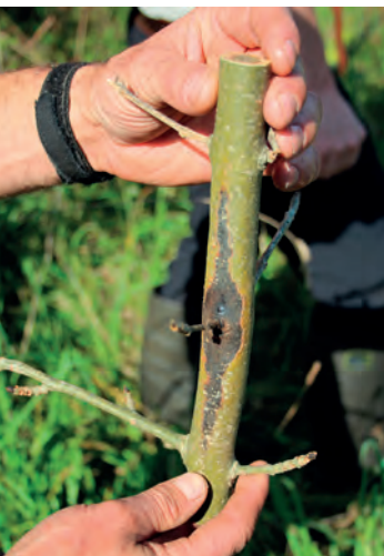
Ash die-back workshop