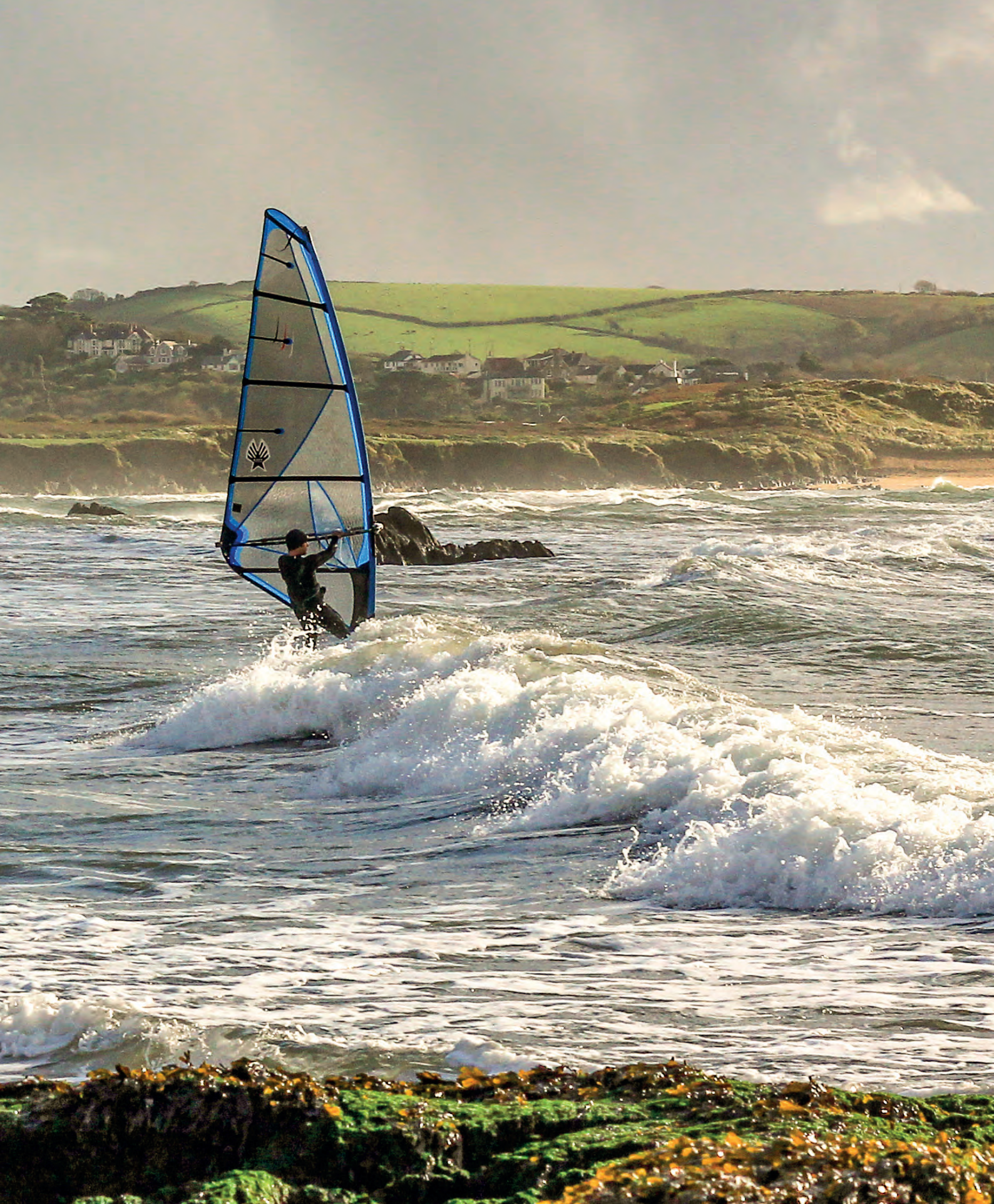
Photo credits: Top p3 © Sarah Sweet, top right p6 © Nicola Cullen, back cover © Philip Williams. All others contributed or © South Devon AONB Unit. Design by South Hams District Council.